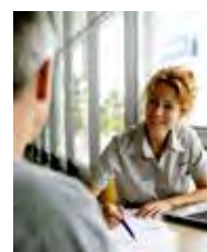
Volvo Financial Services