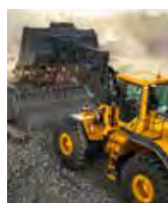
Volvo Construction Equipment